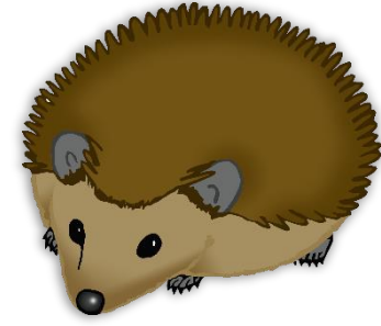
Animal e.g. Hedgehog