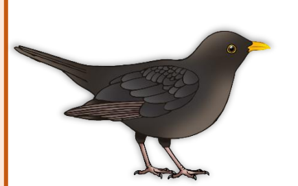
Bird e.g. Blackbird