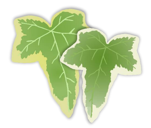
Plant/Flower e.g. Ivy