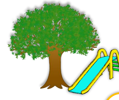
Visit the park