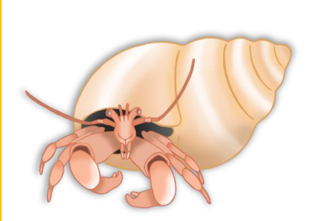
Something that moves