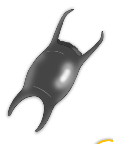
A mermaid's purse (Egg case)