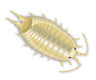
Something very small